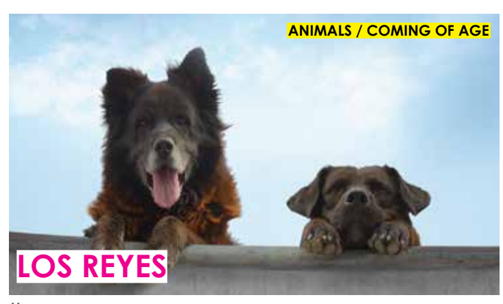
■ SATURDAY, NOV 30 // 1:45 PM Chile / Germany, 2018, 78 min Spanish with English subtitles

"An emotionally complex piece of personal portraiture that intimately reveals the extent to which traditional attitudes still dominate Chinese society regardless of its globalised surface." — Screen International