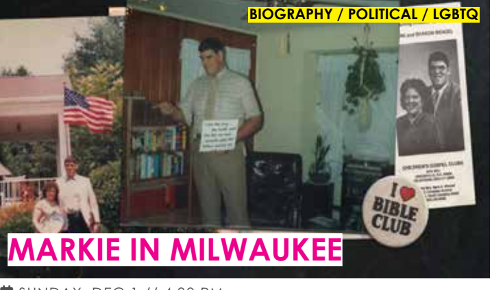
■ SUNDAY, DEC 1 // 4:30 PM United States, 2019, 91 min