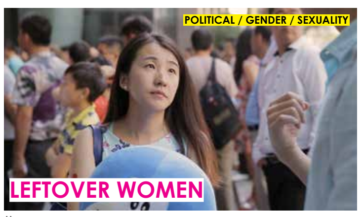
■ SUNDAY, DEC 1 // 2:15 PM Israel, 2019, 85 min Mandarin with English subtitles

'Leftover Women' is how the Chinese describe educated, cosmopolitan women who are not married and settled by the time they reach their mid-20s. Through marriage markets, matchmakers, and government-sponsored dating events, the film follows three hopeful singles who, under immense pressure, are determined to find love on their own terms. With extraordinary access, the film follows these remarkable women on their quest to find Mr. Right before society deems them Leftover.